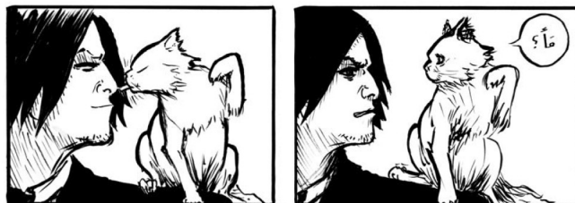
(Image from: “Tarek’s Fantastical Salon,” Samandal 2 , Omar al-Khuri)

For those of you wishing to support local bookstores, rather than some behemoth corporation, I highly recommend the following site: bookshop.org